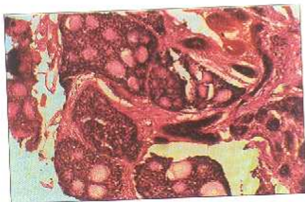
Figure 2 - Adenoid cystic carcinoma of the lung ( H & E 200 )